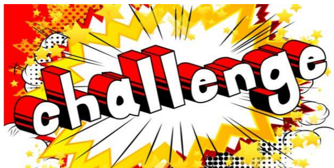
Photo / Video Challenge for National Sports Week

We want to see everyone getting involved in sports this week. If you are undertaking some sporting activity, please do send us a photo or a short video clip (5 seconds only please). We'll share these with everyone on our website and social media.