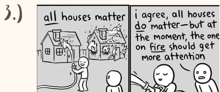
illustration credit: Kris Straub